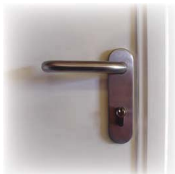
Standard handle with key lock