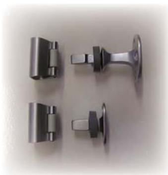
Long and short sliding door stops